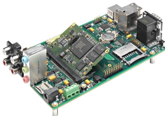
DIMM-Base with processor module DIMM-SH7723

with SODIMM Socket – Reference board for your embedded Project